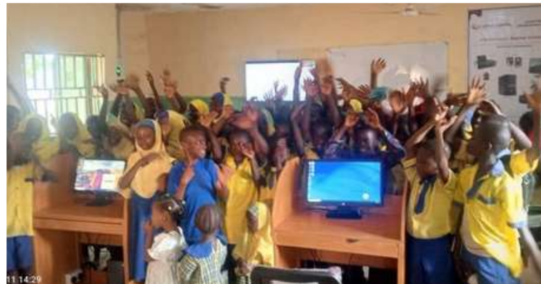
ICT ROOM at the Lagos Island Nursery & Primary School, Lagos