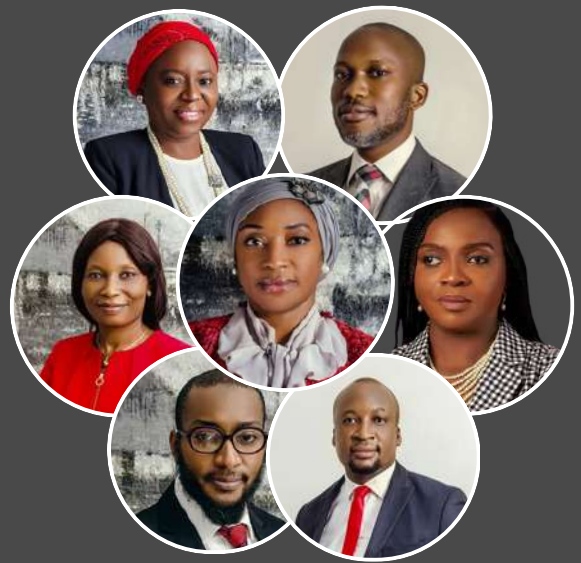
Lotus Capital Management Team